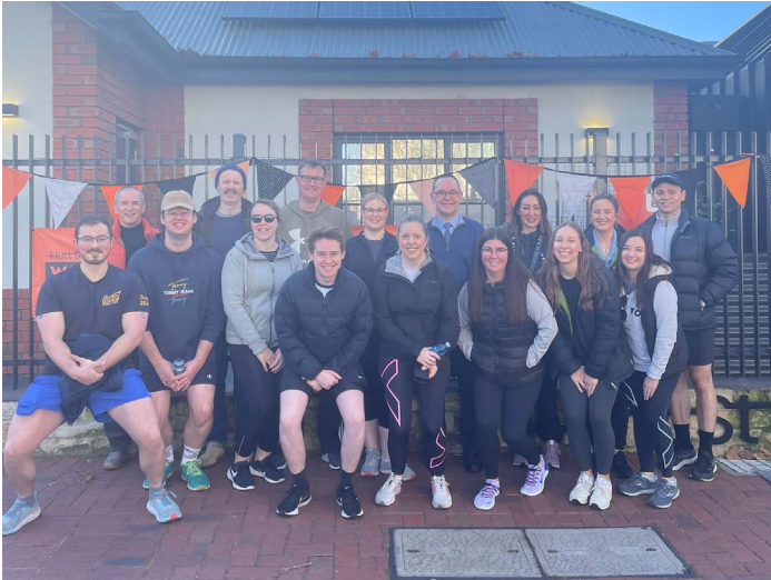
Piper Alderman Staff and Partners visiting Hutt St Centre as a part of the 'walk a mile' fundraising campaign.